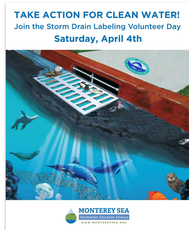
Emblem Labeling Volunteer Day