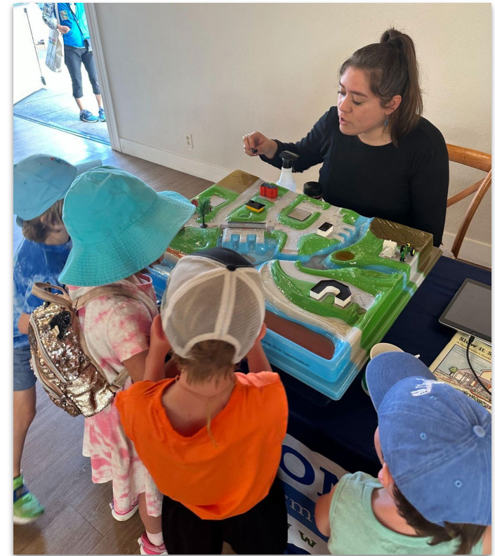
Students at community events!